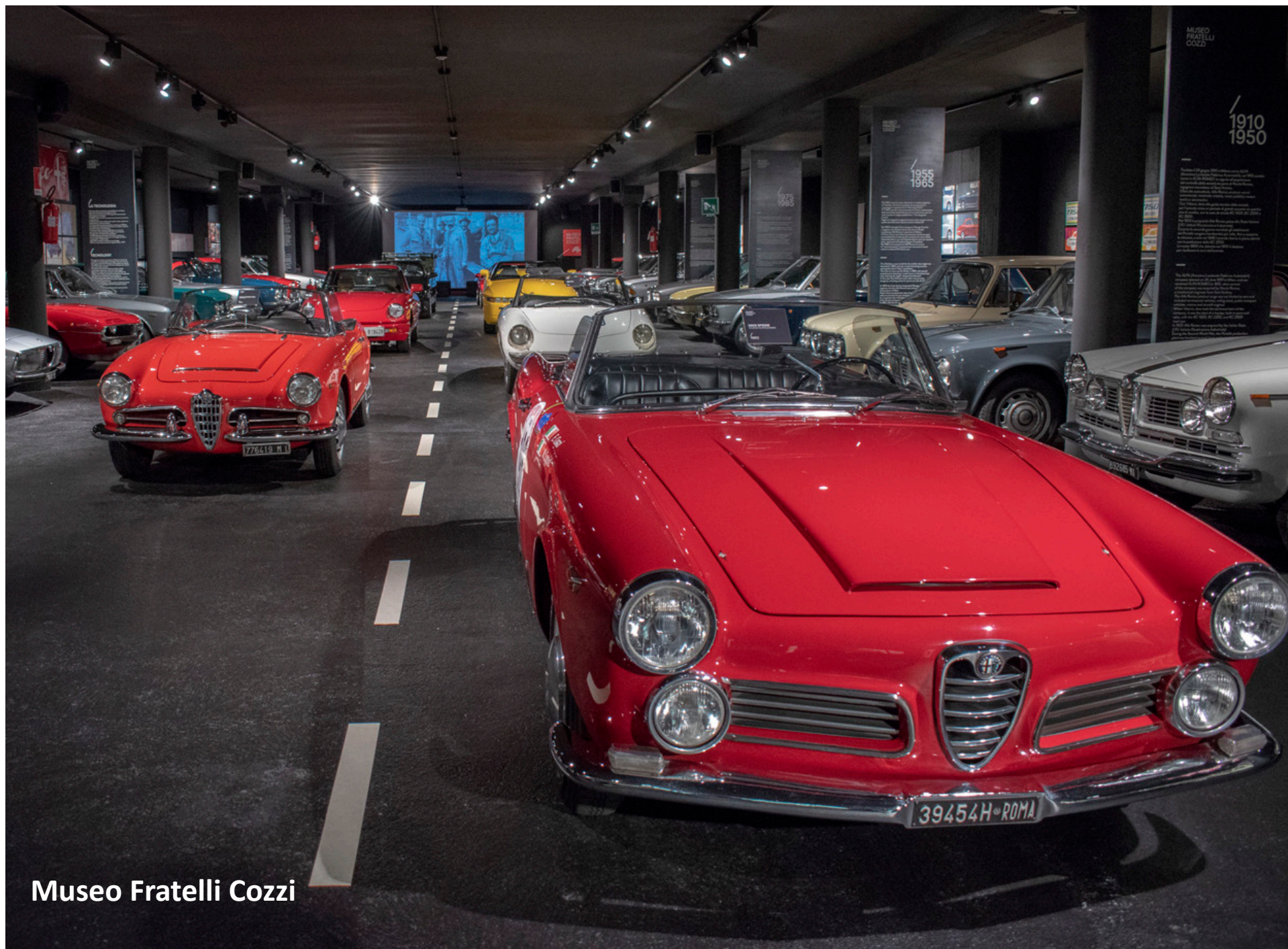
Museo Fratelli Cozzi